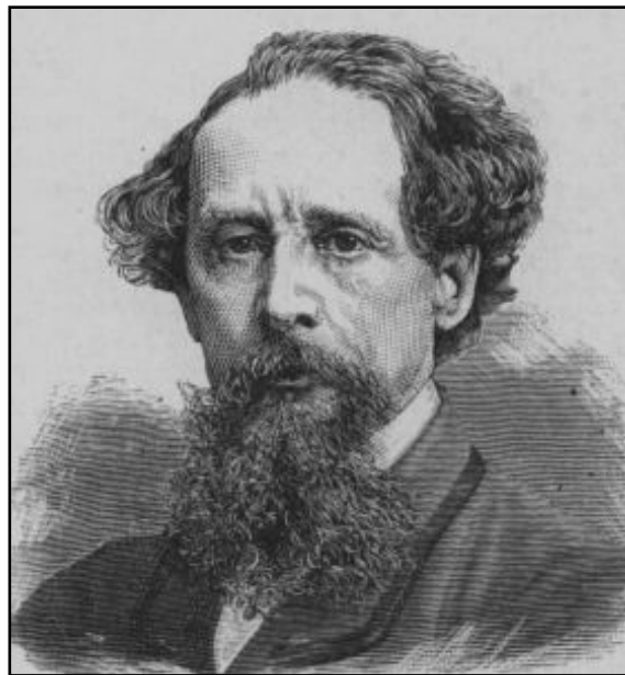
Charles Dickens 7 th February 1812–9 th June 1870

He was a sympathiser to the poor, the suffering, and the oppressed; and by his death, one of England's greatest writers is lost to the world.