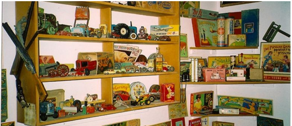
Toys at Northbrook Colonial Museum

Prior to the dinner a visit was made to the adjacent Northbrook Colonial Museum which has an extensive range of New Zealand's social history displayed across 9,000 sq ft of buildings. Already in Victorian dress, we stepped farther back in time to experience products, materials and technology from yesteryears, including a collection of toys, tractors, and an early Rangiora street. In crinolines, top hats and tails, we our selves became part of the Victoriana on display as we meandered through the exhibits.