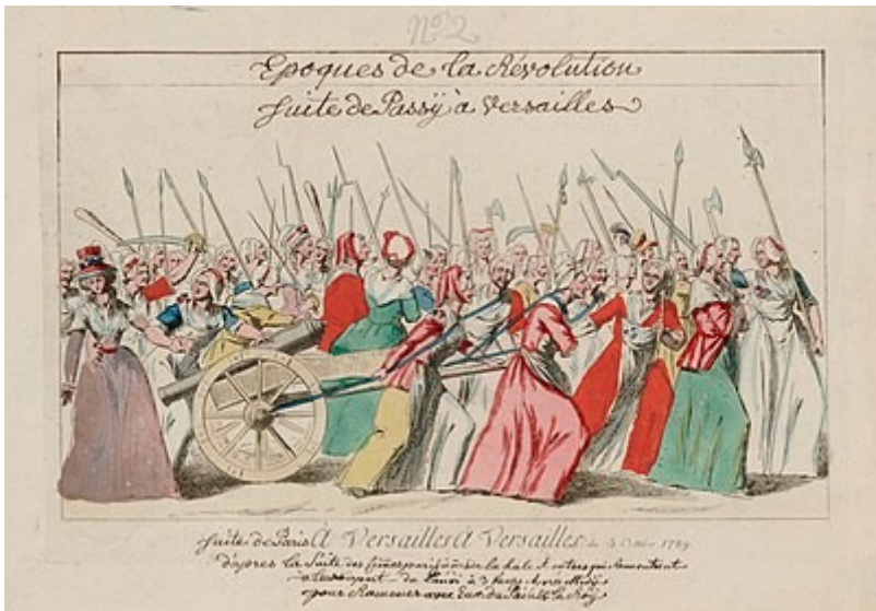
Women’s march on Versailles 1789

The Dickens Magazine , Series 3, Issues 1 and 3, A Tale Of Two Cities.