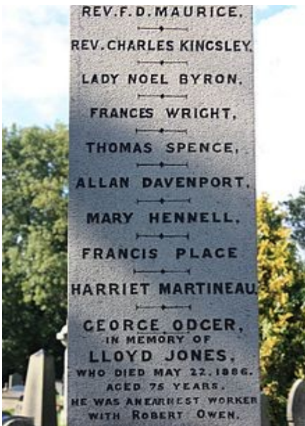
Reformers Memorial, Kensal Green Cemetery.

Similar ideas had been written by one Thomas Spence, an English radical who advocated common ownership of land.