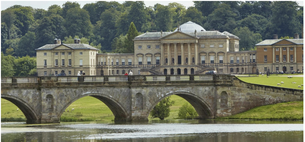
An English country house, Kedleston Hall, built 1765

1785 saw the publication of the newspaper Daily Universal Register , which was renamed The Times in 1788. The number of Circulating Libraries increased dramatically in the 1770s as publishers and authors sought to take advantage of the new wave of novels being written and the increased number of people who could read.