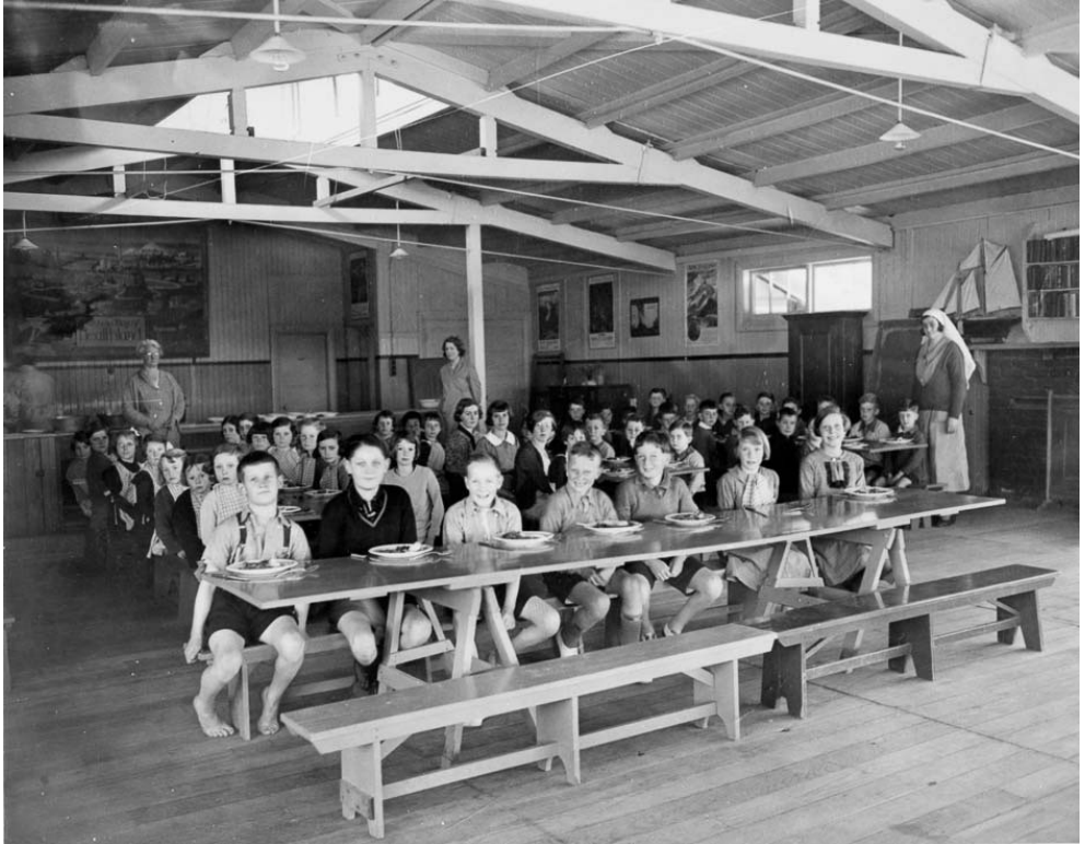
The dining room of a New Zealand Health Camp in the 1940s

the orphanage in Grace's case. Both girls attended the Technical College and were well supplied with clothing and school books already. Therefore it was decided that: