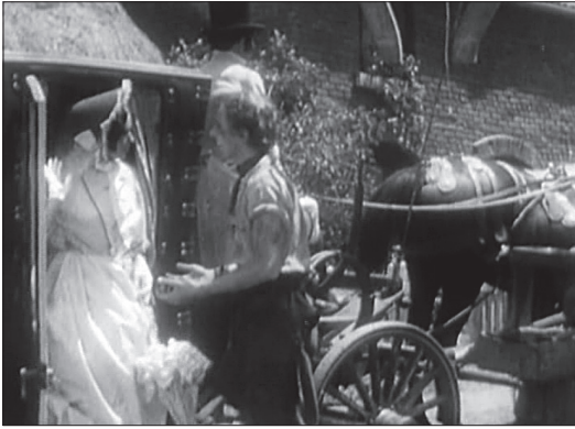
Fig. 3. Estelle greets 'black' Pip: scene from Great Expectations (1934), Universal Studios.

Adaptations ). This depiction has a major implication: there is a lack of contrast between young Pip, the good-hearted child, and adult Pip, as depicted in the novel, with his growing snobbery and moral decline towards selfishness and rejection of his humble origin (indeed, one of the key issues that Dickens explores). After Pip moves to London to begin a new life as a gentleman, the figure of Joe vanishes, while Biddy does not appear at all. Whereas in the novel adult Pip is ashamed of Joe's lack of culture and rejects his origins, in the film these feelings are simply omitted, thus avoiding again any corruption of the protagonist. The keen interest of the picture in presenting Pip as a candid and naïve character shows up, additionally, in the absence of Trabb's boy and Orlick. As McFarlane has rightly pointed out in Screen Adaptations... , Trabb's boy and Orlick portray 'provincial young men who don't inherit property and who are, subsequently, in the novel, made the objects of Pip's superior denunciations'. Furthermore, the absence of Orlick avoids showing his attempt to murder Pip, a thorny subject for a film addressing viewers of all ages.