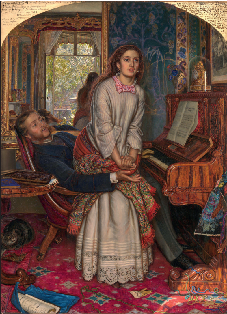
Fig. 2. William Holman Hunt. The Awakening Conscience . 1853. Oil paint on canvas, 762 x 559 mm. Tate Britain, London.

presentation of Lady Dedlock's portrait. For example, as Guppy and Tulkinghorn deepen their investigation, the portrait becomes covered with 'bars and patches of brightness' (p. 182); later with 'broad strips of sunlight shining in, down the long perspective, through the long line of windows, and alternating with soft reliefs of shadow' (p. 255). These descriptions of light and shadow playing upon the surface of the portrait create the impression of the represented lady as locked behind bars, thus reflecting