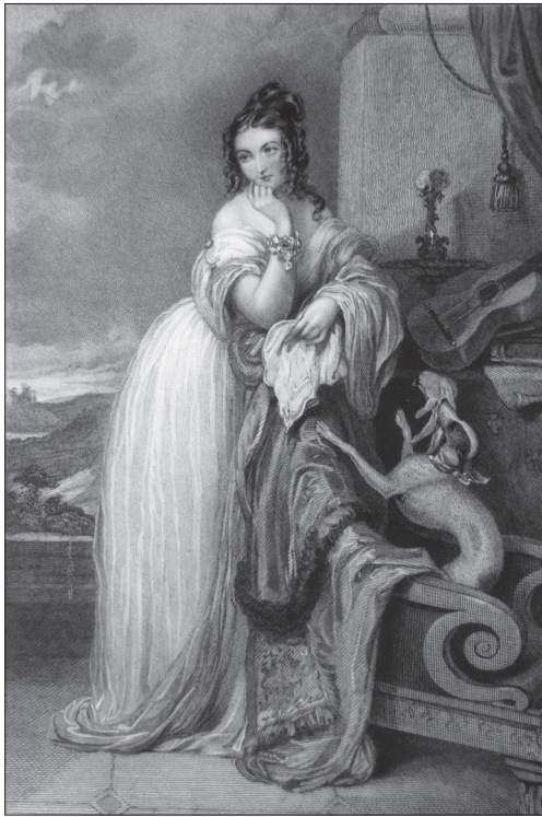
Fig. 5. 'The Marchesa', Heath's Book of Beauty (1835), Copper plate engraving.

visiting Mayall's studio for their article 'Photography', which was published in Dickens's weekly magazine Household Words , Henry Morley and W. H. Wills described how one 'lady's dress was not at all ill chosen for a photographic sitting or a masquerade'. In addition, they commented upon Mayall's 'mysterious designs', 46 which Dickens – having sat for Mayall in 1852, six months before the advertisement appeared – described as 'the little eccentricities of the light and the instrument'. 47 In the advertisement these techniques are presented as the 'admirable tinting and execution of draping'. They are thus elements of artistic arrangement that deliberately alter the appearance of the sitter in order to enhance it. Such a practice of manipulating photographs to intentionally mislead the viewer was inconsistent with the belief that the camera provided an objective, accurate representation of the sitter. Ironically, the advertisement's claims for the veracity of photographic portraits are undercut even as they are advanced. 48 For instance, the advertisement, while promoting the 'artistic treatment' and transformation Mayall's studio offers, simultaneously argues for 'images without the slightest distortion'.