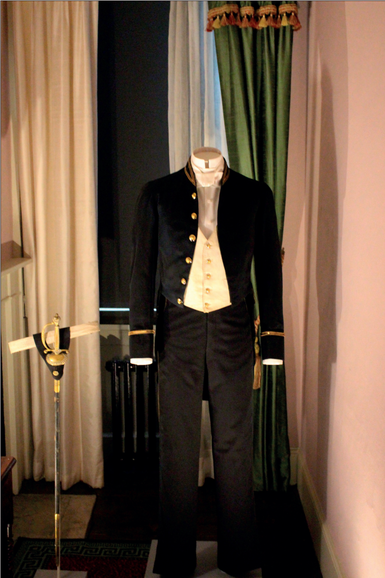
Dickens's Court Suit: The Charles Dickens Museum.