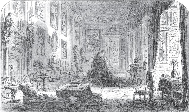
Fig. 3. Hablot Knight Browne ("Phiz"). Sunset in The long drawing-room at Chesney Wold. 1853.