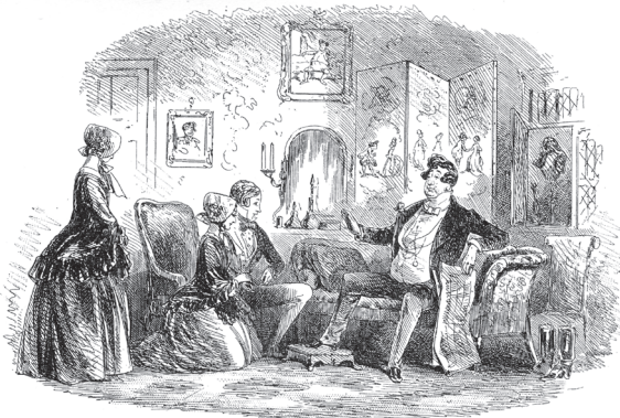
Fig. 1. Hablot Knight Browne (“Phiz”). A model of parental deportment. 1853.