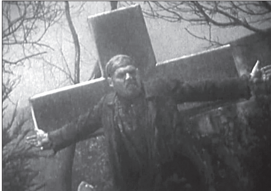
Fig. 2. Magwitch in the churchyard: scene from Great Expectations (1934), Universal Studios.

taken of how Magwitch appears before Pip in a cruciform posture (Fig. 2.), thus suggesting early in the film that the convict will be punished for his crime. But the cross is also the most important Christian symbol, representing the atonement and the victory over sin and death that will save Magwitch's soul. All these alterations clearly appealed to both religious and educational organisations in their demands for moral and instructive pictures.