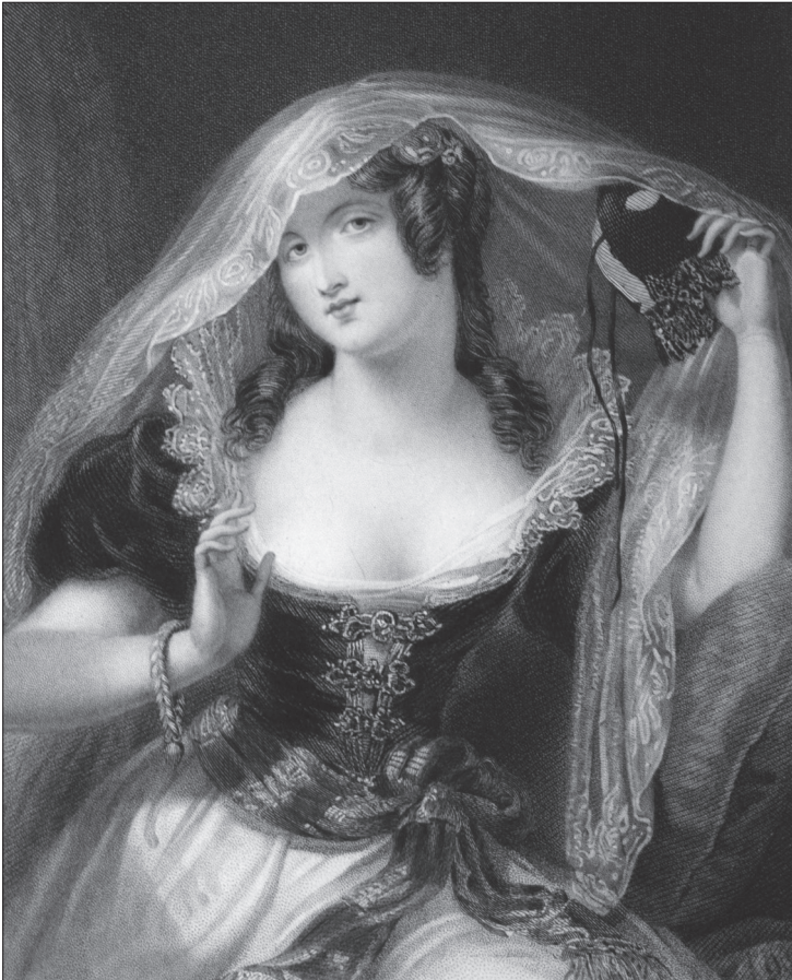
Fig. 4. ‘The Mask’, Heath’s Book of Beauty . 1833. Copper plate engraving, such were often taken from oil portraits through photographic means.

not just costumed, but masquerade in ‘fancy dress’; and they are staged in an endless ‘variety’ of theatrical scenes (pp. 330-31). They are ‘art, combined with capital’, and therefore present specifically superficial middle-class aspirations (p. 330).